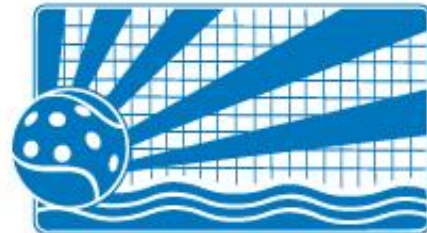
Guilford Racquet & Swim Club